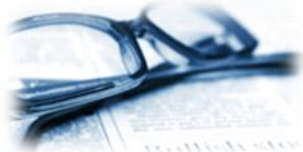
MENA ICT CONFERENCE

MENA ICT week brings together the premier ICT stakeholders from around the region, including Arab Telecom Ministers, and key members of the public and private sectors, and civil society. The event will consist of numerous events happening concurrently under the same roof, including the MENA ICT Conference which brings together key regional industry leaders to discuss challenges and opportunities regarding the industry; the Arab Golden Chip Awards, which recognizes leading figures driving ICT change around the region; and a series of ICT workshops, The WITSA Trade Mission - business matching events, and an Shaam ICT Expo, which will showcase the latest trends and innovations from around the ICT world in addition to many side events. The event is being held in cooperation with the World IT and Services Alliance (WITSA), the Syrian Computer Society (SCS), and UN ESCWA.