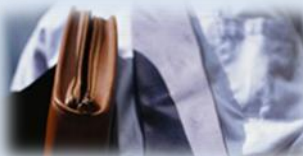
BUSINESS MATCHING EVENTS