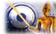
ARAB GOLDEN CHIP AWARDS